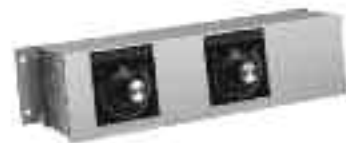
Model RMB-7C with two infinite switches

*Under UL requirements, cord and plug can only be purchased for portable units (with C-Legs, T-Legs, or chain and S-Hooks)