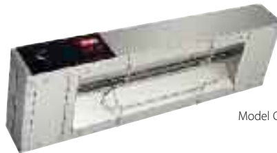
Model GR-18 standard unit