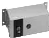
Model RMB-3F with toggle switch and indicator light