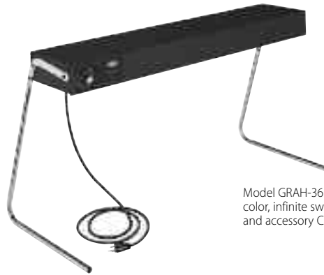
Model GRAH-36 with optional Designer color, infinite switch, cord and plug set*, and accessory C-leg stand